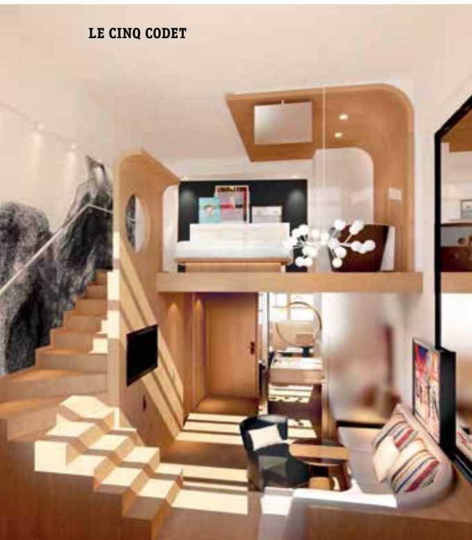
LE CINQ CODET