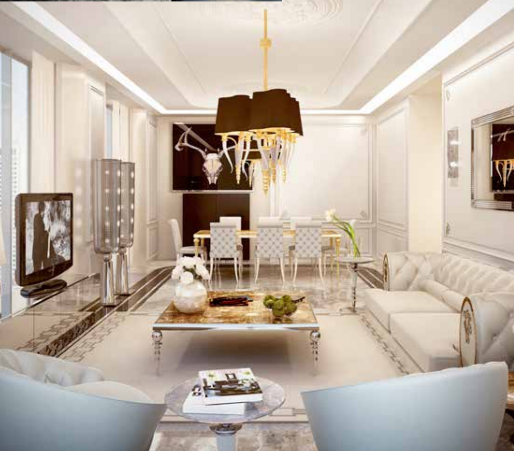
THE REVERIE SAIGON

5 Escape the city buzz and head up to Mekong Villas , the latest member of the Secret Retreats collection. The collection of villas offers an excellent sight of Laos and the Mekong River, while its decor reflects the unspoiled allure of its lush surroundings. The rich local flavours, presented in the rustic architecture and the seasonal menu served up at the villas, make for an idyllic getaway. For leisure, paddle on the expansive Mekong with the canoes available. From THB3,000 (S$118) per night in a log cabin, minimum three nights stay. 96 Moo 6, Leab Mekong River Road, Ban Kok Pai, Pakchom District, Loei Province. Tel: +66 0 2222 1290