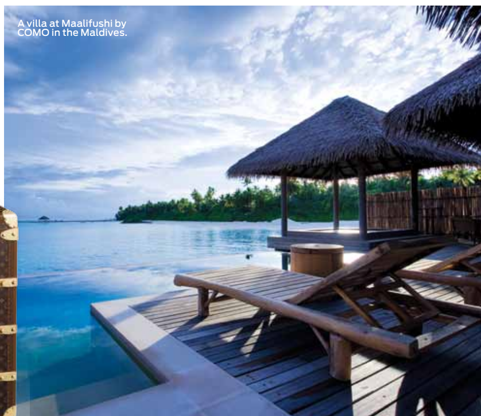
A villa at Maalifushi by COMO in the Maldives.