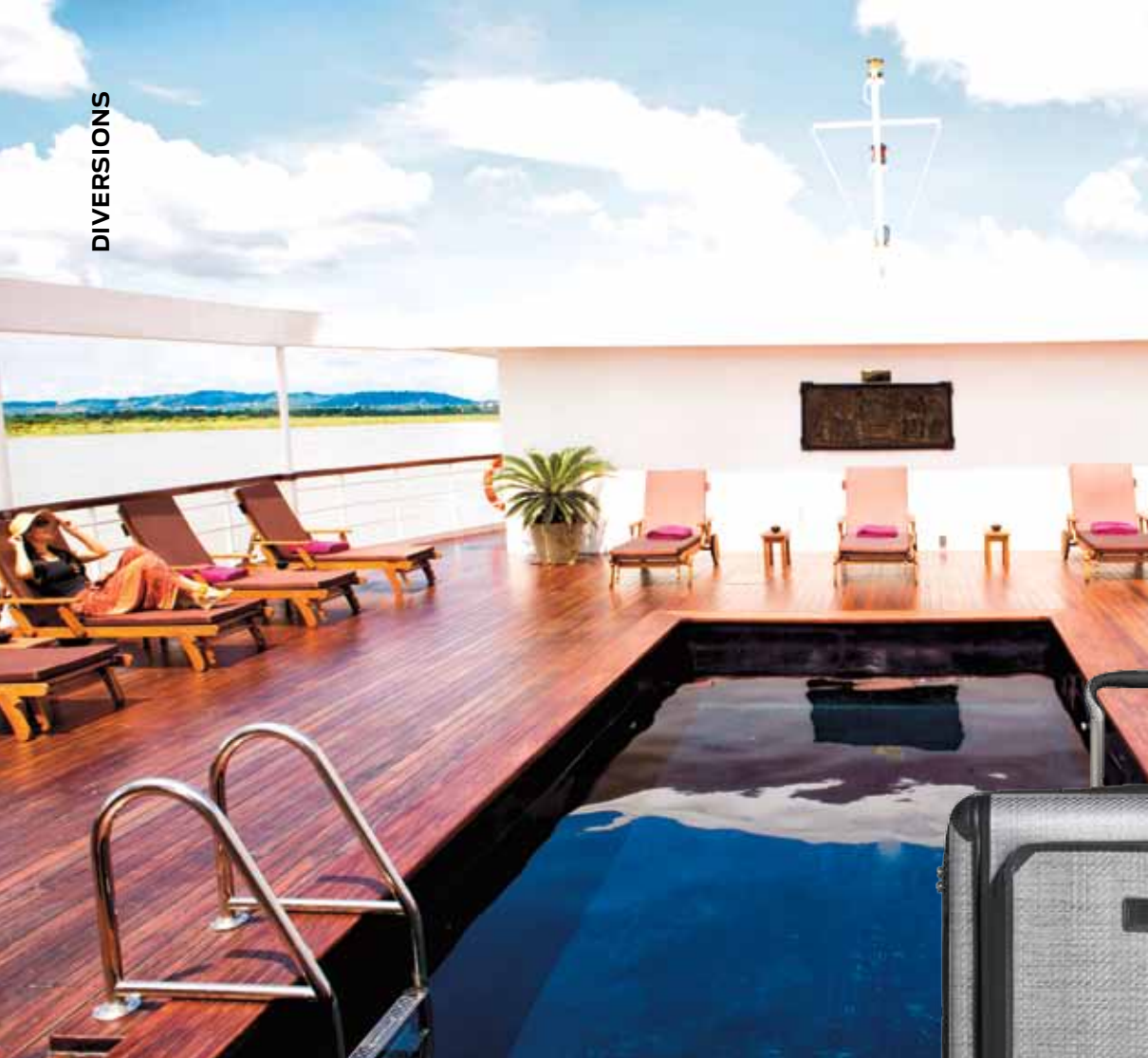
LEFT: The pool on the Orcaella .