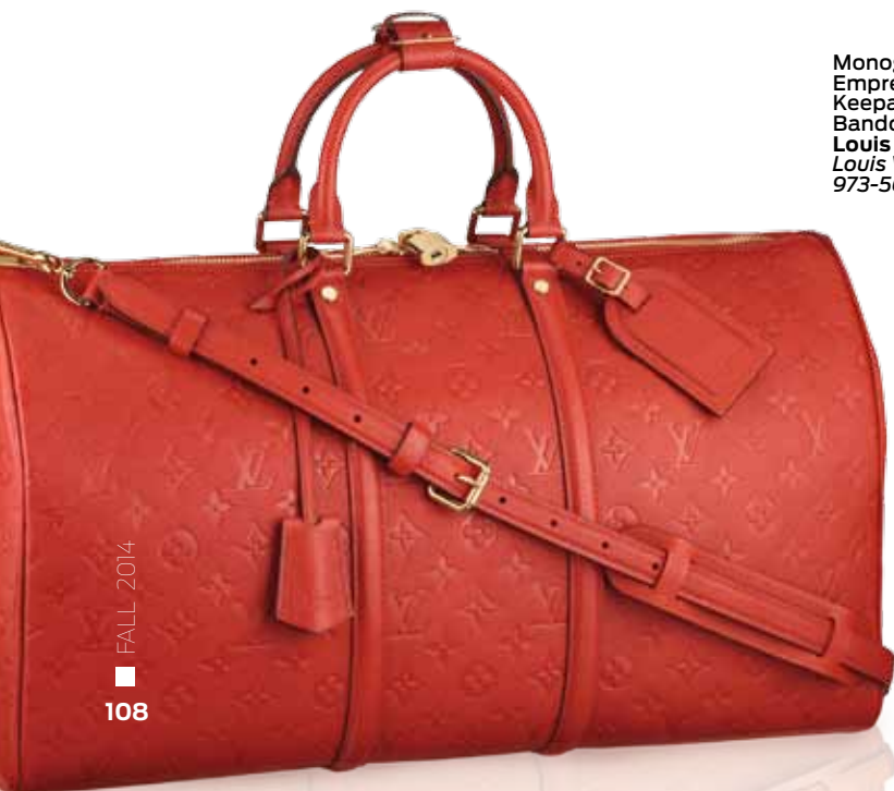
Monogram Empreinte Keepall Bandouliere, Louis Vuitton. Louis Vuitton, 973-564-9788

Anantara Sir Bani Yas Island Al Yamm Villa Resort is both a mouthful and an eyeful. Sheikh Zayed bin Sultan Al Nahyan, founder and late ruler of the United Arab Emirates, introduced millions of trees and thousands of animals—including ostriches, giraffes, gazelles, cheetahs, and a herd of 400 Arabian oryx—to the 34-square-mile island, 150 miles from Abu Dhabi and a tantalizing five from shore. The resort's 30 luxury villas are set among mangrove forests and saltwater lagoons studded with white and pink flamingoes. Many of the villas have private plunge pools, and a few are quite sprawling. You're more likely, however, to be captivated by the sea (that's what al yamm means). Go for a swim in the Arabian Gulf, or arrange a fishing, kayaking, snorkeling, or scuba diving excursion through the water sports center. Yet what really sets Al Yamm apart is that you can also go on a safari, then tour the island's archeological excavation of a sixth-century monastery, shoot a quiver of arrows on the archery range, play some tennis, or ride a horse across the dunes. A kids' club, teen club, swimming pool, library, gym, and half a dozen dining options will enhance your stay—but be sure to leave time for a Sands of Time massage at the Anantara Spa. This signature treatment combines hot sand compresses, a floral foot ritual, and sports massage. al-yamm.anantara.com