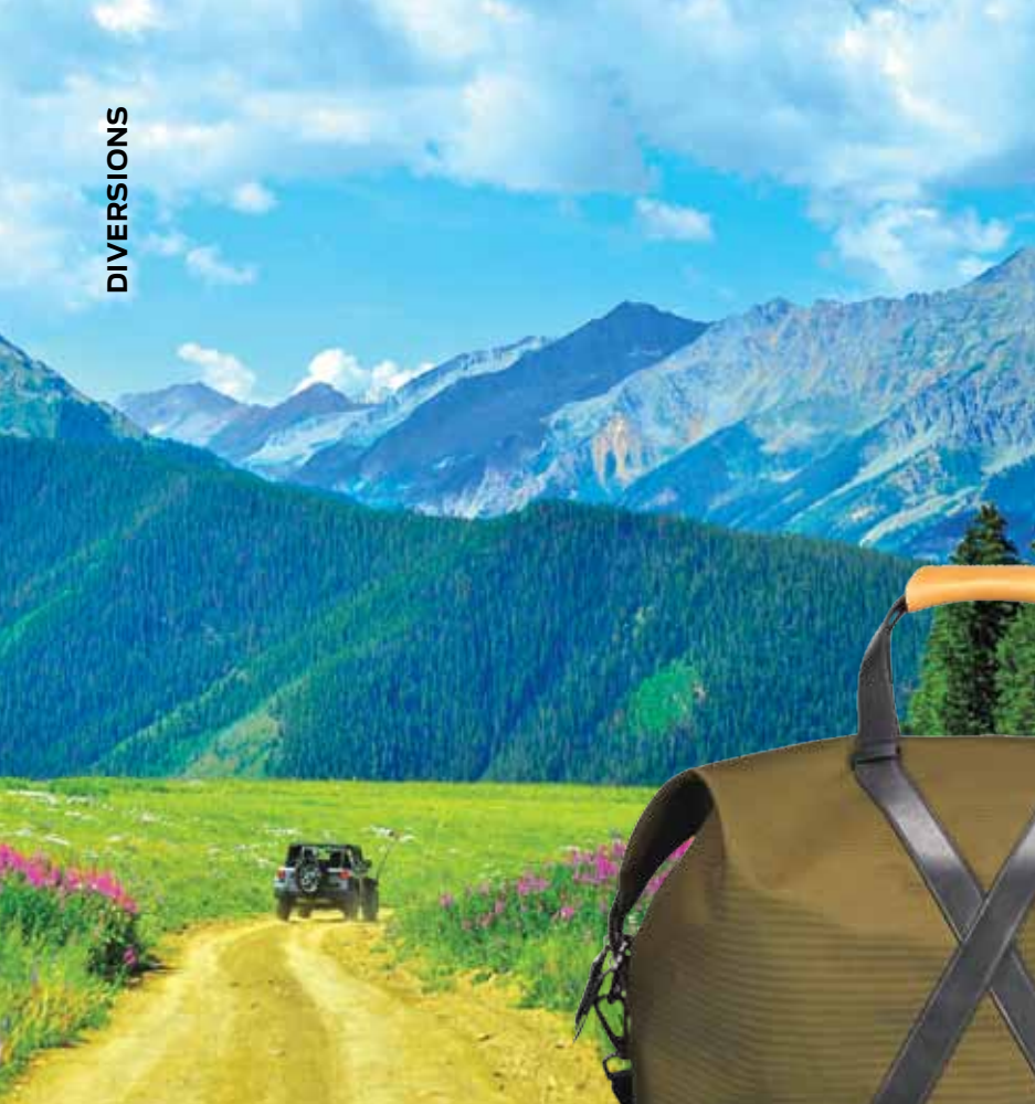
Little Annie's Road, on the back of Aspen Mountain. LEFT: Bashford duffel, Tumi. Tumi, 973-376-8800