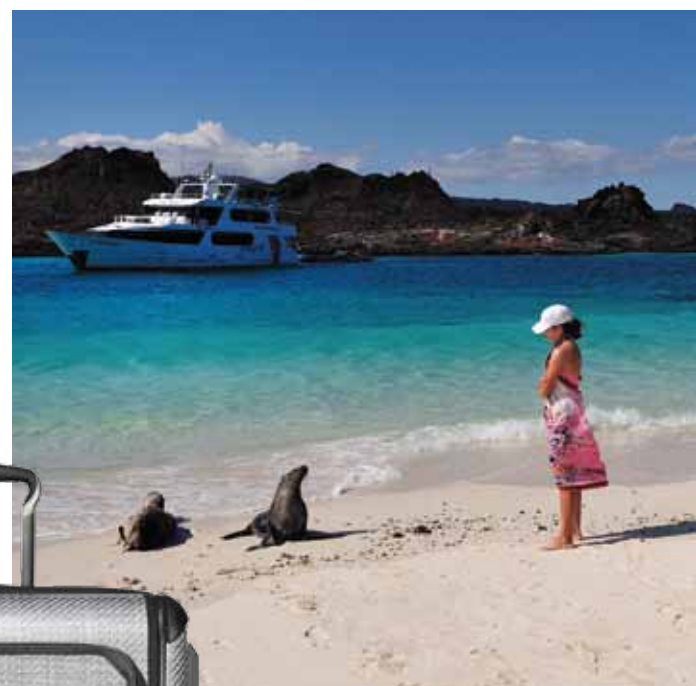
ABOVE: A daylong excursion on Pikaia Lodge's private yacht includes meals on board and land visits that bring you close to the wildlife of the Galapagos. LEFT: Tegra-Lite Max extended-trip packing case, Tumi, 973-376-8800