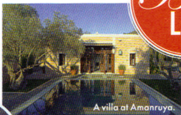
A villa at Amanruya.

T he biggest bedrooms in the city, the best location, by St Isaac's Cathedral. The terraces are at the same height as the dome of St Isaac's, and if one is in urgent need of vodka—and perhaps some caviar—head for the ravishing Xander Bar. Due to open this May. fourseasons.com