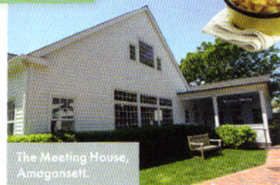
The Meeting House, Amagansett.