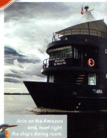
Aria on the Amazon and, inset right, the ship's dining room.