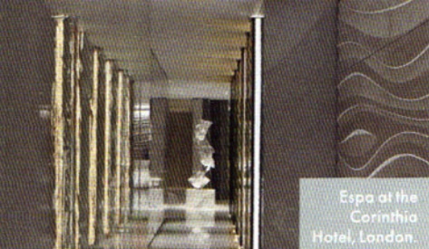
Espa at the Corinthia Hotel, London.